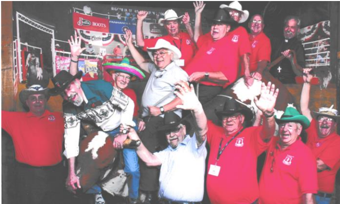
It's a Baker's Dozen taming that bull at Billy Bob's!

And a good time was had by all!!!!!!!!!!!!!!!!!!!!!! What more can I say besides this year's reunion in the Dallas/Fort Worth area was a huge success.